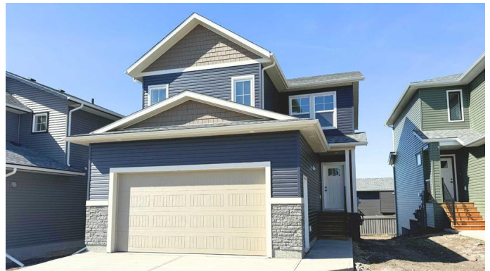
The REDMOND II 2,000 sq. ft.