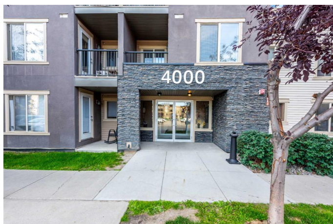
210-403 MacKenzie Way SW, Airdrie, AB