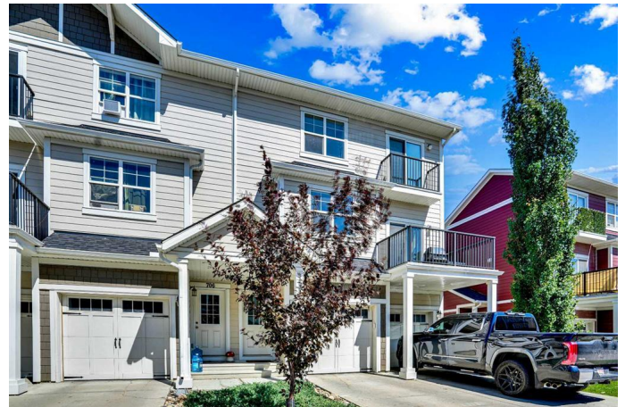
707-881 Sage Valley Blvd NW, Calgary, AB

Main Building: Total Exterior Area Above Grade 1202.39 sq ft